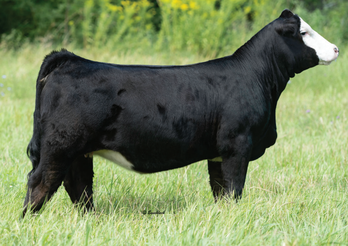
SIRE | NGDB STRUCTURE 34D