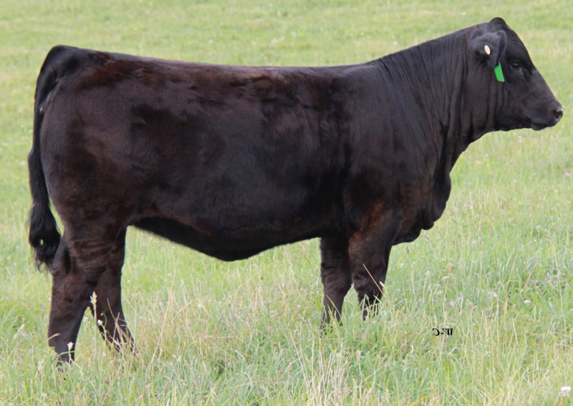
SIRE | MADER THE NATIONAL 43E