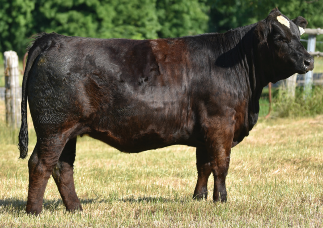
SERVICE SIRE | IRCC GUSTO 903G