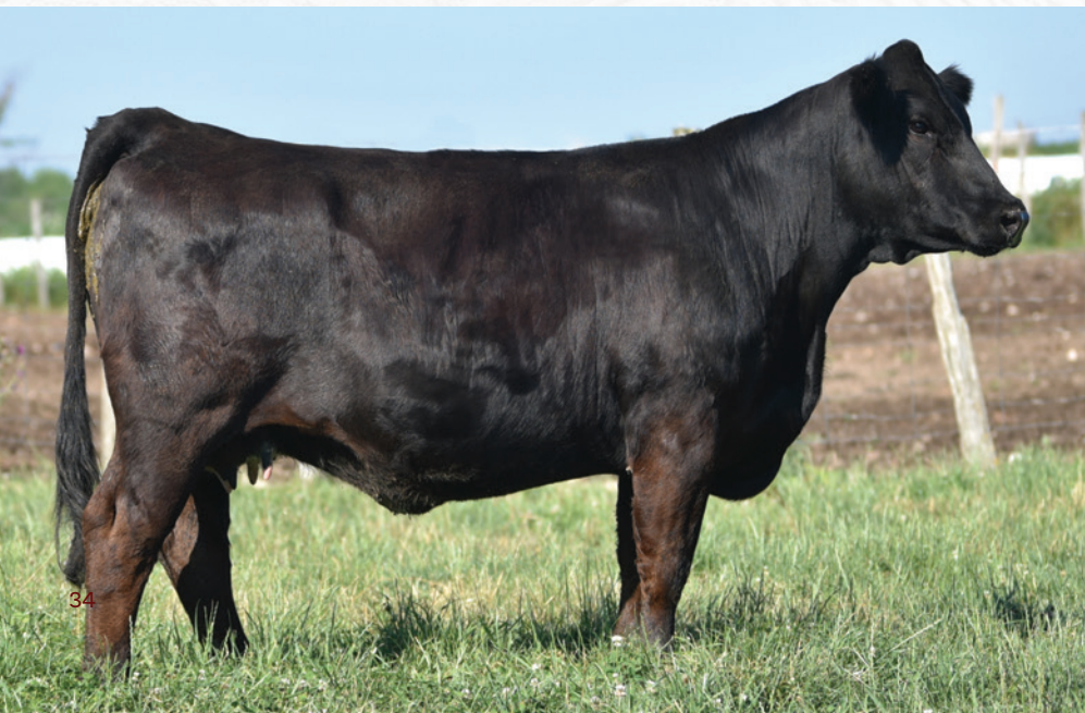
SIRE OF LOT 61 | MR HOC BROKER