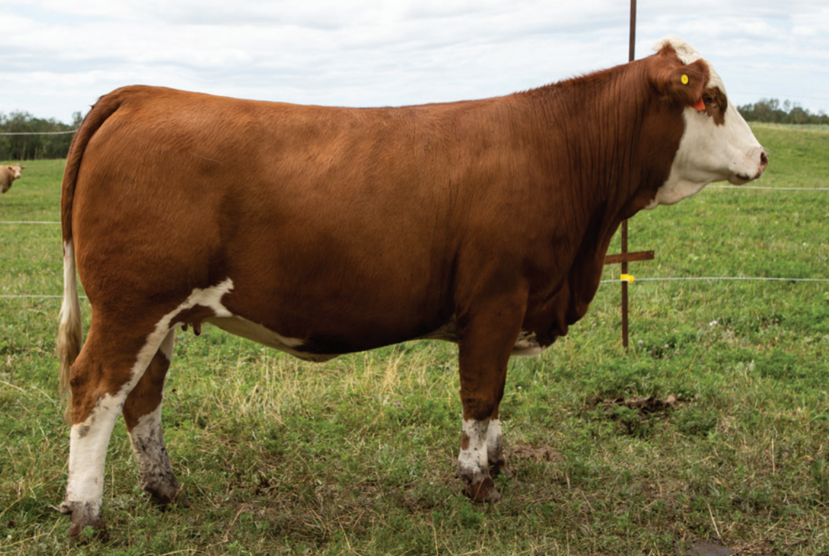
SERVICE SIRE | ULTRA/CD LEGEND 401F