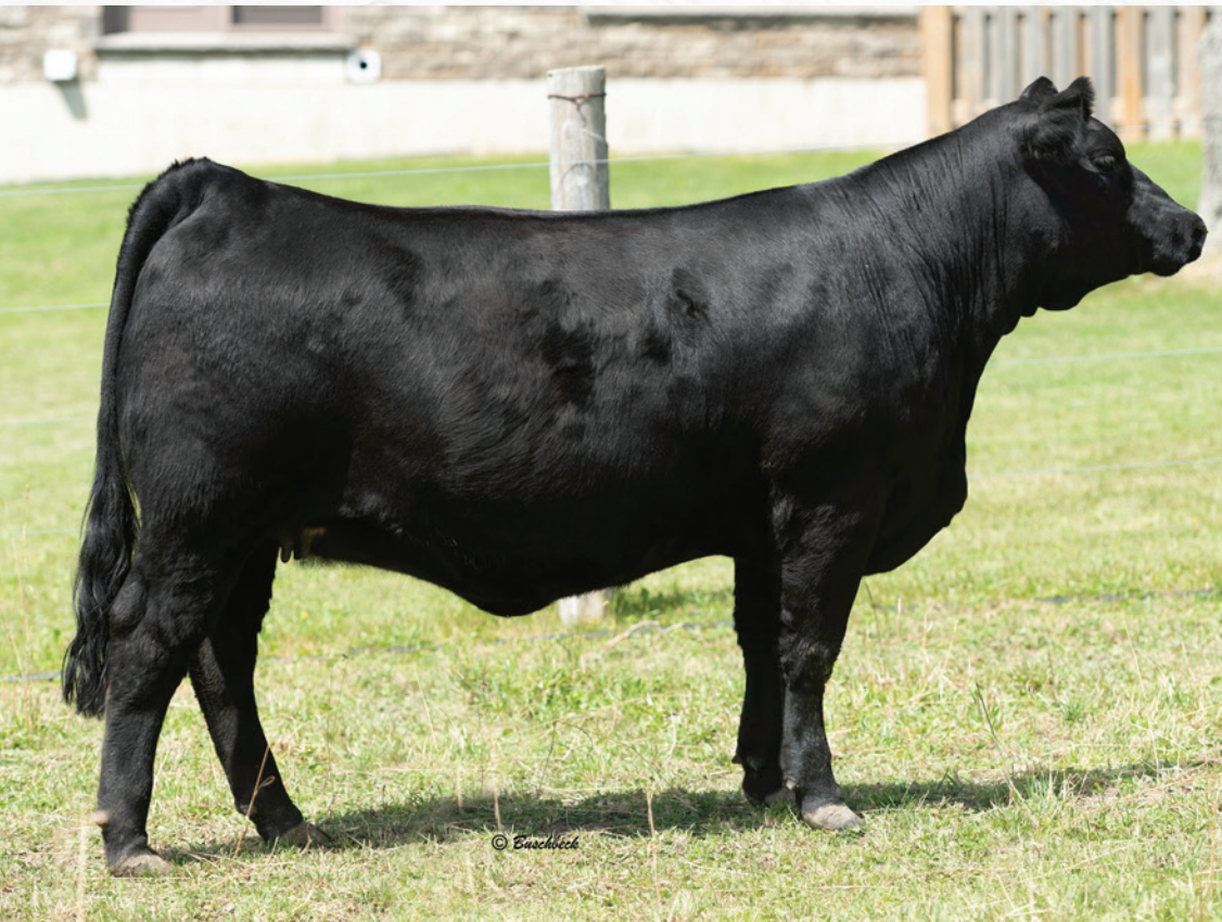
LOT 52 | 2021 OYCSA TRILLIUM CLASSIC GRAND CHAMPION BRED & OWNED