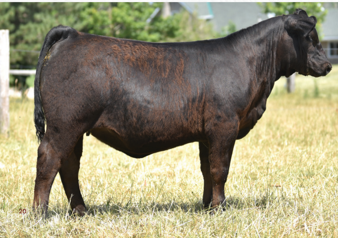
SIRE | RF SUPERCHARGED 9150G