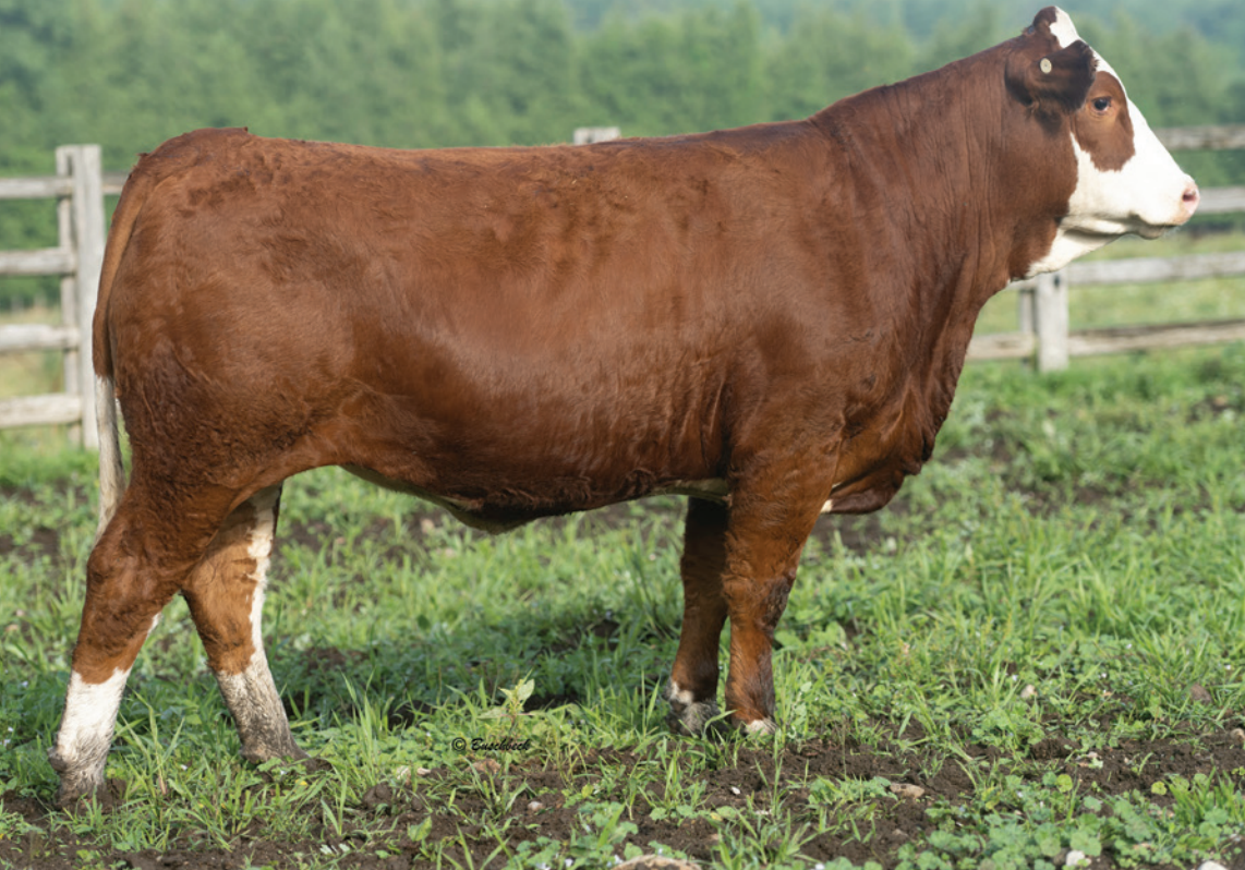
SISTER | CAR-LAUR 800G AT LARCH GROVE FARMS