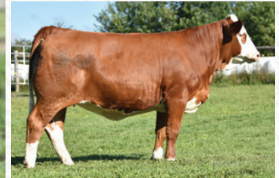
DAM | CAR-LAUR MISS ELLA 800E