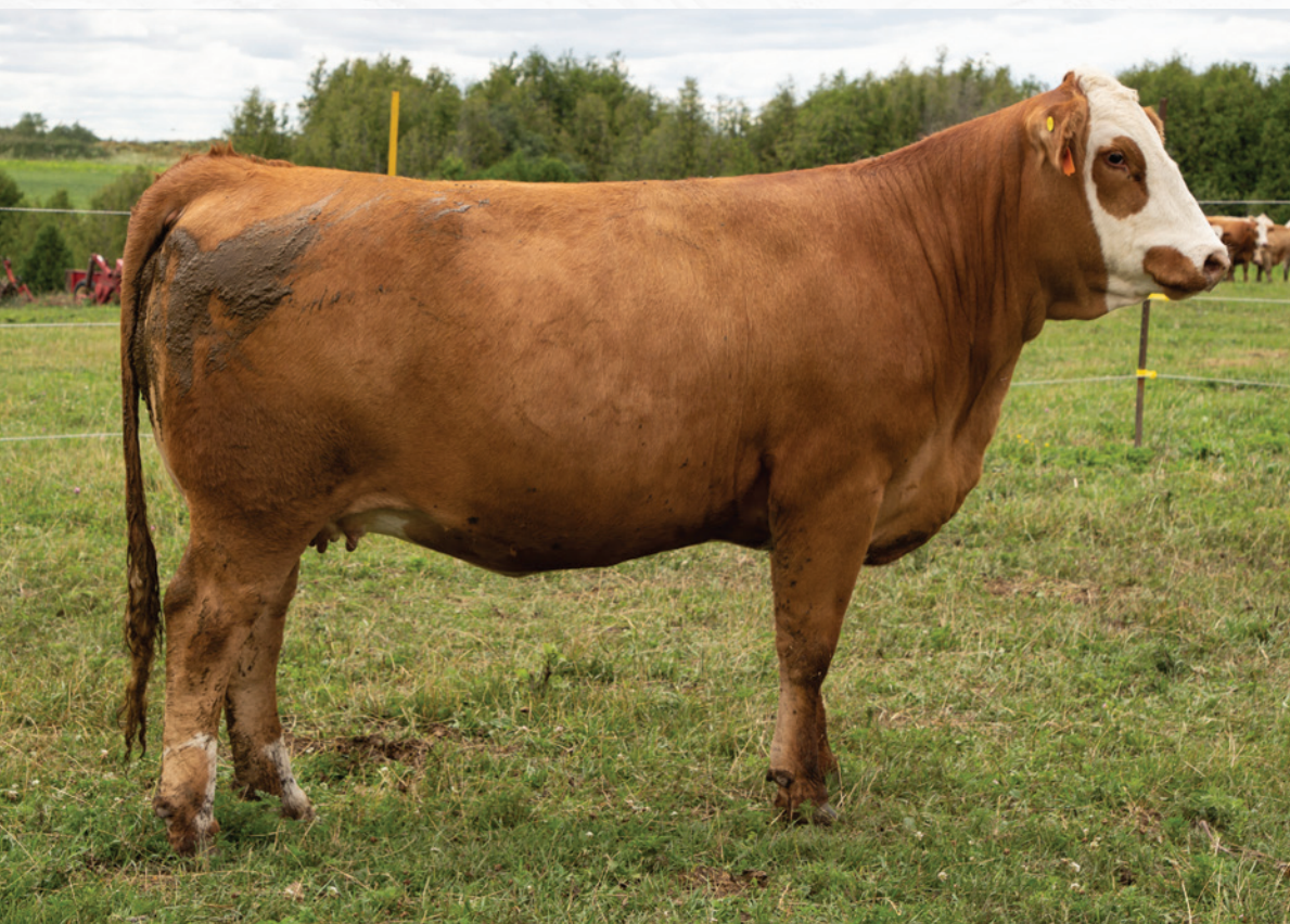
GRANDDAM | PHS HOMOZYGOUS YUMMY